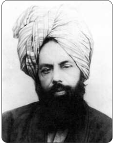
Hazrat Mirza Ghulam Ahmad – The Promised Messiah and Mahdi (peace be upon him)

The Ahmadiyya Muslim community was founded in 1889 by Hazrat Mirza Ghulam Ahmad (1835-1908) of Qadian, India. He claimed to be the expected reformer of the latter days and the awaited one of the world's religions (the Messiah and Mahdi of the latter days). His mission was to revive the peaceful teachings of Islam and engender in people's hearts the love of God and the duty to serve mankind.