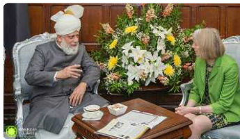
Rt Hon Theresa May MP, Prime Minister of the United Kingdom

His Holiness regularly meets presidents, prime ministers, other heads of state, parliamentarians and ambassadors of state. He has delivered keynote addresses in the UK Parliament, Capitol Hill, the European Parliament, the Dutch Parliament and New Zealand Parliament emphasising the need for absolute justice.