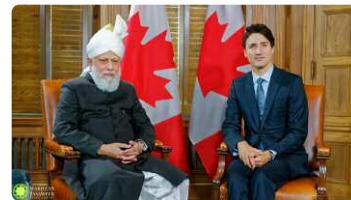
Rt Hon Justin Trudeau MP, Prime Minister of Canada