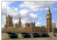
House of Commons, UK Parliament, London