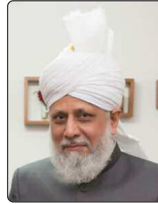
Hazrat Mirza Masroor Ahmad – Head of the worldwide Ahmadiyya Muslim Community

“Be kind and merciful to humanity, for all are [God's] creatures: do not oppress them with your tongue, or hands, or in any other way. Always work for the good of mankind.”