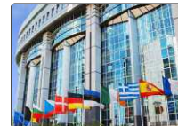
European Parliament, Brussels, Belgium