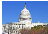
Capitol Hill, Washington, USA