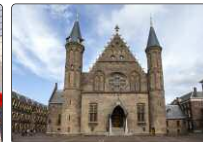
Dutch Parliament, the Hague, Netherlands