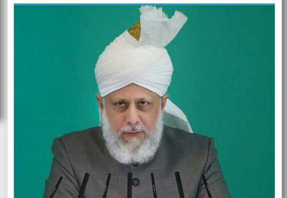
Calls for limiting free speech so that the religious sentiments of people are protected.

By Web Desk Published: September 23, 2012