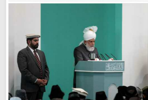
Ahmadiyya Muslim worshippers in Morden and Southfields were told the recent outbreaks of violence by protestors were not following the true teachings of Islam

9:48am Monday 24th September 2012 in News