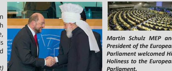
Martin Schulz MEP and President of the European Parliament welcomed His Holiness to the European Parliament.

(Hadhrat Mirza Masroor Ahmad – December 2012)