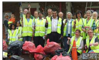
Working with local communities we help to keep Britain tidy with litter picking campaigns held throughout the UK.

In sunshine, rain or snow we provide help wherever we can. Be it visiting the sick and elderly in hospitals and care homes, providing food and provisions for the homeless or clearing autumn leaves and winter snow, a helping hand is always there.