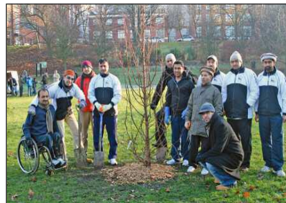
Ahmadi Muslim youth take an active interest in environmental issues and have planted more than 3,000 trees in Britain in the past two years.