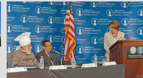
U.S. Democratic Leader Nancy Pelosi welcoming His Holiness to U.S. Congress.