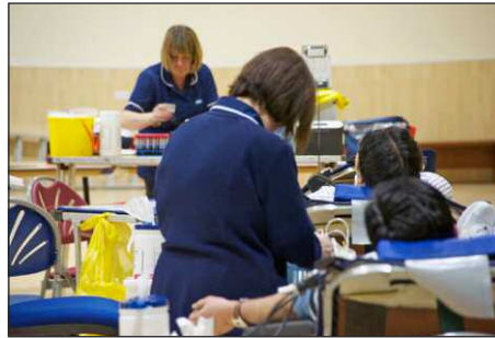
Blood donation sessions are held regularly at our mosques and community centres and more than 2,700 units of blood have been collected in the past two years alone.