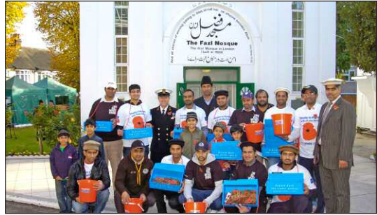
Young members raise thousands each year for the Poppy Appeal.

Islam underlines service to humanity as a core pillar of a peaceful society. The Ahmadiyya Muslim community actively engages in serving society and whether it is through raising funds for charitable causes or by volunteering in local community projects we are keen to play our part for the good of mankind.