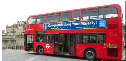
The community sponsored 200 buses carrying a message of congratulations on the Queen's Diamond Jubilee. The official launch of the buses at the Tower of London was followed by the 'Queen's Diamond Jubilee Charity Walk' at the tower that was attended by 2,500 participants and raised more than £300,000. Over the past few years our annual charity walks have raised one and half million pounds for UK charities.